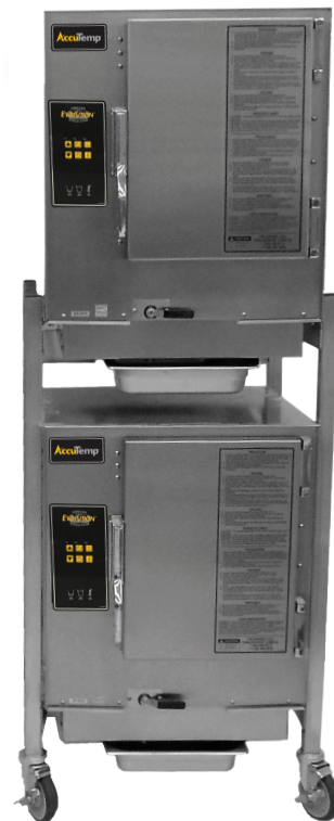
N6 Evolution™ Models shown with optional drain pan and stand with casters

Evolution™ steamer is AccuTemp Products' connectionless, boilerless steam cooker that utilizes AccuTemp's Patent Pending Steam Vector Technology for faster cook times, improved energy efficiency, better pan to pan uniformity, and less water consumption. Steam Vector Technology requires no moving parts inside the cooking chamber. Steam to be produced inside the cooking cavity with no heating components exposed to water. Unit to be powered by a Heavy Duty Stainless Steel Blue Flame Power burner. Uses less than 1 gallon of water per hour. Unit to include low water, high water, overtemp warning lights and auto shut off feature. Evolution™ to include heavy duty, field reversible door. Standard digital controls with independent timer. No water quality exclusions to warranty and no water filtration or treatment required. Units to be mounted on a stainless steel support stand. Unit to be UL Safety and Sanitation Certified, and Energy Star qualified. Built in USA.