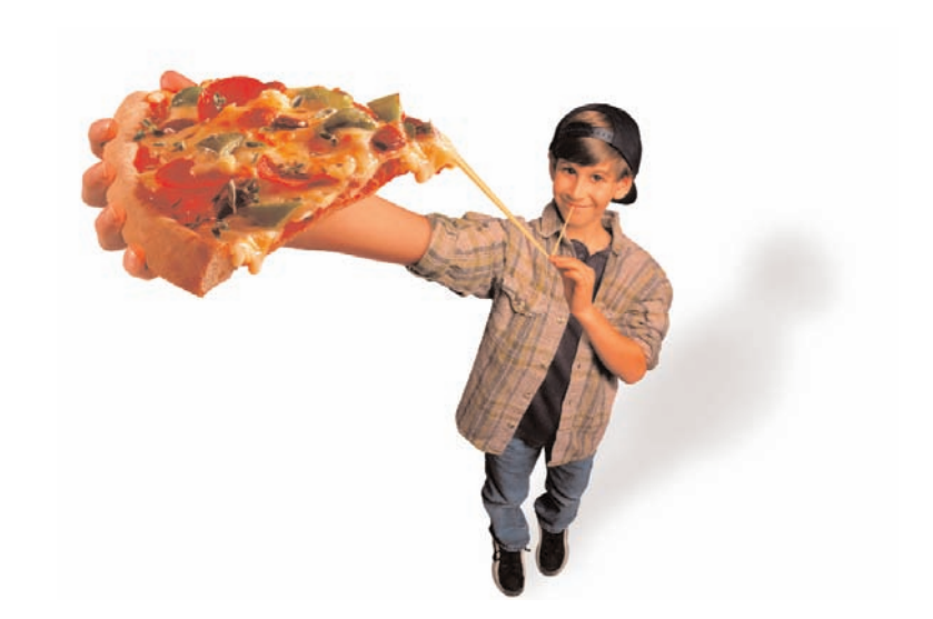
Deliver It Hot