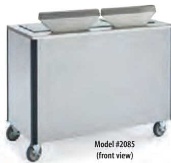
Model #2085 (front view)

Induction models with two or three cooktops feature a power management package as standard and require 220 VAC 50 amp circuit with NEMA 14-50P plug. On units that do not include the power management package, each 120 VAC induction cooktop requires its own 20 amp circuit. Filter(s) can be included on each circuit. Induction units available without Power Management Package.