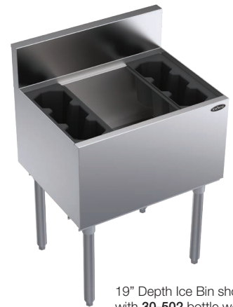
19" Depth Ice Bin shown with 30-502 bottle wells