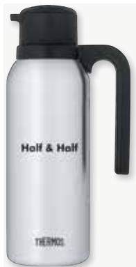
FN363/TGB10SCHH6* NSF Cert. S.S. Vac. Carafe Twist/Pour "HALF & HALF" Imprint 0.9 L (32 oz) L: 4 1/2" W: 5 1/2" H: 11 3/8" 6 Pc.