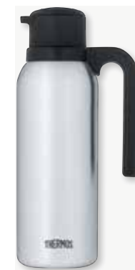
FN362/TGB10SC* NSF Cert. S.S. Vac. Carafe Twist/Pour 0.9 L (32 oz) L: 4 1/2" W: 5 1/2" H: 11 3/8" 6 Pc.