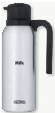
FN366/TGB10SCML6* NSF Cert. S.S. Vac. Carafe Twist/Pour "MILK" Imprint 0.9 L (32 oz) L: 4 1/2" W: 5 1/2" H: 11 3/8" 6 Pc.