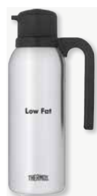
FN365/TGB10SCLF6* NSF Cert. S.S. Vac. Carafe Twist/Pour "LOW FAT" Imprint 0.9 L (32 oz) L: 4 1/2" W: 5 1/2" H: 11 3/8" 6 Pc.