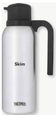
FN367/TGB10SCSK6* NSF Cert. S.S. Vac. Carafe Twist/Pour "SKIM" Imprint 0.9 L (32 oz) L: 4 1/2" W: 5 1/2" H: 11 3/8" 6 Pc.