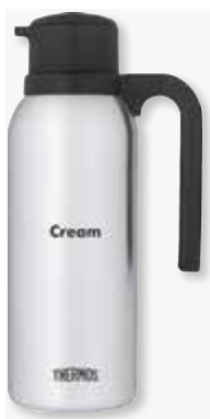
FN364/TGB10SCCR6* NSF Cert. S.S. Vac. Carafe Twist/Pour "CREAM" Imprint 0.9 L (32 oz) L: 4 1/2" W: 5 1/2" H: 11 3/8" 6 Pc.