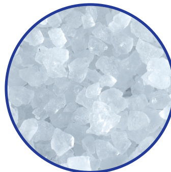
Ice shown actual size

Flake ice is small hard bits of ice ideally suited for presentation applications.