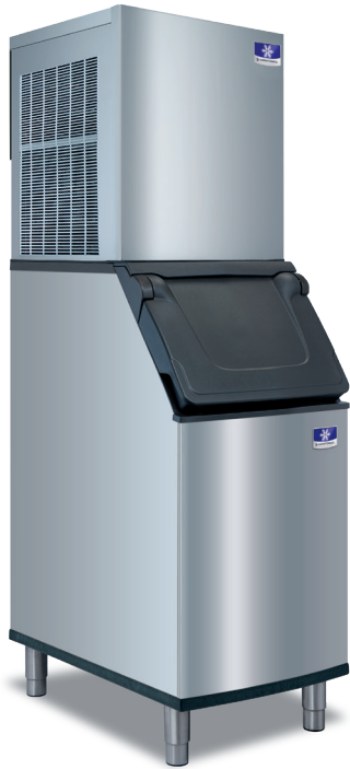
Model RFP0320A Flake Ice Machine on D-420 Bin