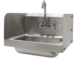
Double Sided Bolt-On 7-3/4" Side Splashes Shown Hardware Not Included