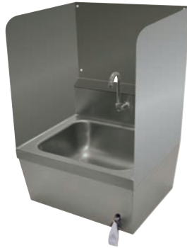
24" Side Splashes With Included Back Panel Shown Factory Installed Only

Bolt-on Side Splashes (field installation) require drilling holes in hand sink to match holes in side splash. Mounting hardware is not included.