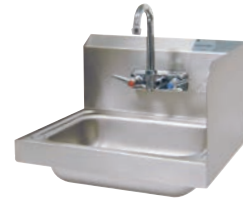
Single Sided 7-3/4" Side Splash Shown Factory Installed Only