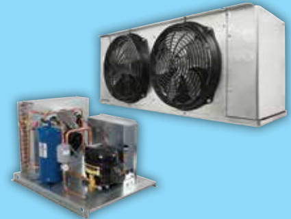
SPLIT-PAK™ REMOTE SYSTEMS INDOOR & OUTDOOR MODELS**