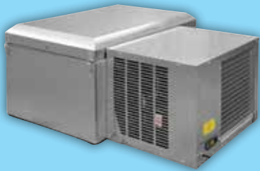
CAPSULE PAK™ SELF-CONTAINED SYSTEMS INDOOR & OUTDOOR MODELS