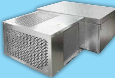
CAPSULE PAK ECO™ SELF-CONTAINED SYSTEMS INDOOR MODELS ONLY