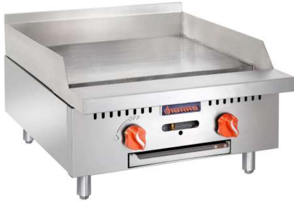
MODEL SRMG-24 (Pictured above)