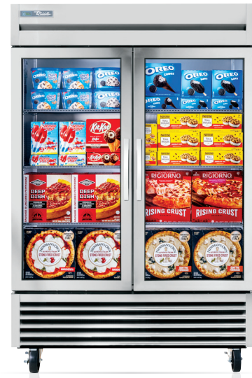
Stadium / Venues