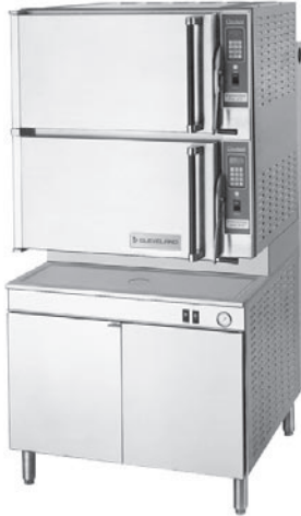
Shown with optional Electronic Timer