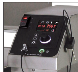
easyDial Control Panel with Core Temperature Probe