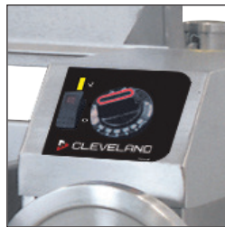
Standard Control Panel