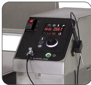
easyDial and Core Temperature Probe options