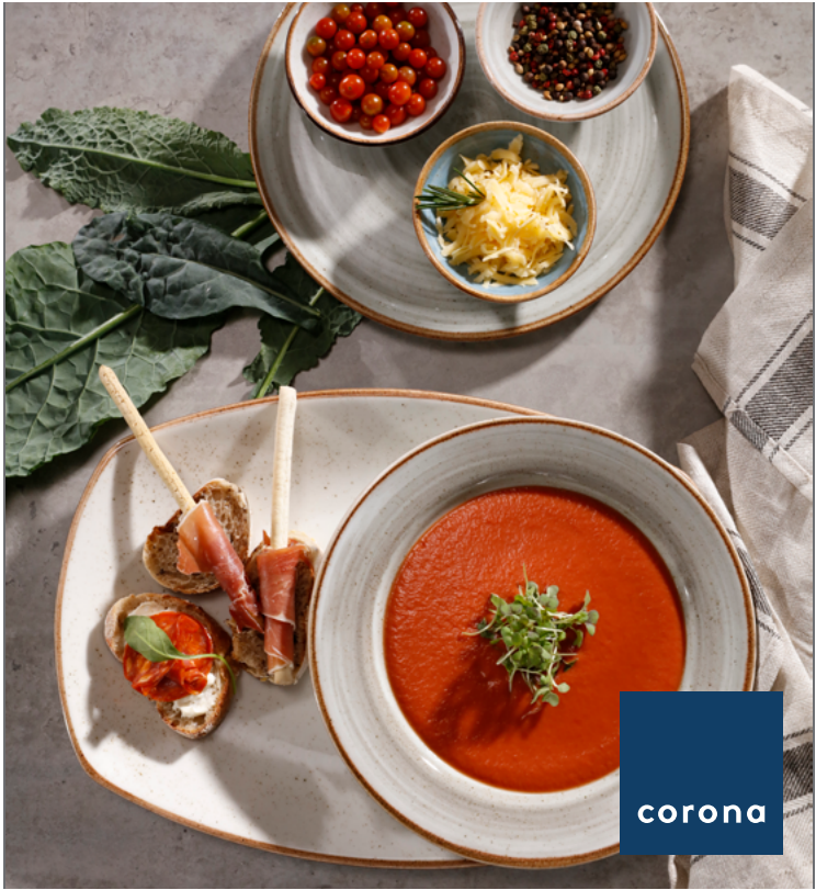
See Corona's Artisan Beige and Artisan Gray collections for similarly styled porcelain.

Request a Sample: https://resources.get-melamine.com/get-sample-request