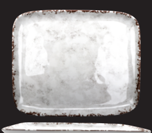
CS-1412-FM Rectangular Platter 14" L x 11.5" W 6 ea.

CS-146-FM Rectangular Platter 14" L x 5.5" W 12 ea.