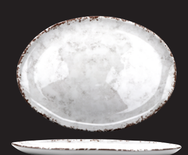
CS-1813-FM Oval Platter 18" L x 13" W 3 ea.