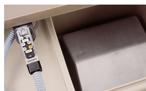
Exclusive Cold Plate