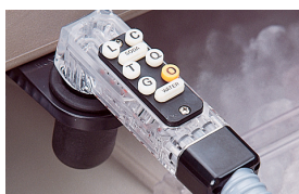
Post-Mix 8 button (BAR730 Complete System)

FEATURES Cambars® offer a variety of features to satisfy any beverage needs