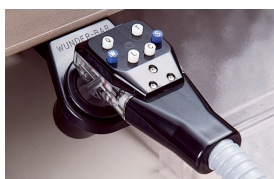
Pre-Mix 6 button (BAR730 Complete System)