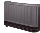
Granite Gray with Black Base 420