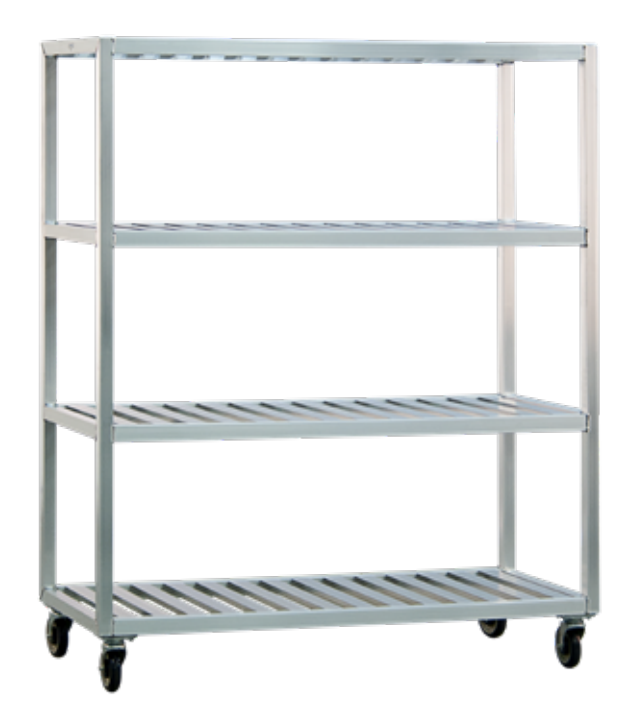
1062TBM5 - Above unit is a 1062TB with 5" wheels