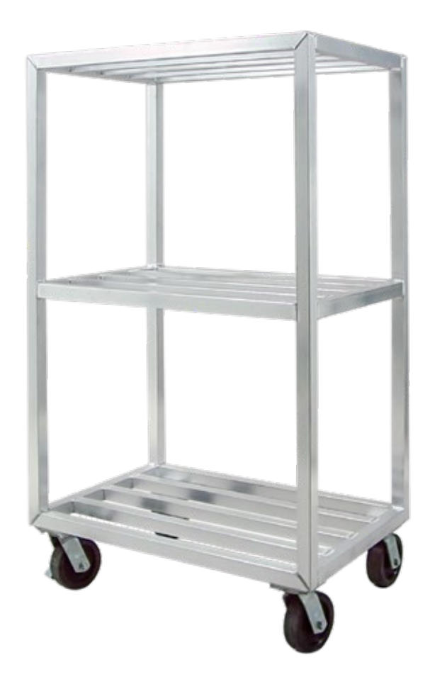
1041M6CL - Above unit is a 1041 with 6" wheels and caster locks

Mobile units include a heavy-duty, threaded plate that is welded to each corner of the base — which provides addition strength and stability to the unit, as well as a slab to bolt casters to.