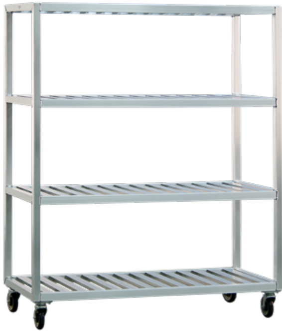
1062TBM5 - Above unit is a 1062TB with 5" wheels

Mobile units are available with either five- or six-inch casters, both sizes offer the caster lock option.