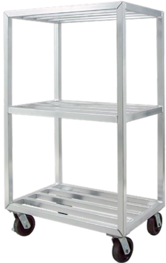
1041M6CL - Above unit is a 1041 with 6" wheels and caster locks

Mobile units include a heavy-duty, threaded plate that is welded to each corner of the base — which provides addition strength and stability to the unit, as well as a slab to bolt casters to.