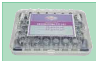
CDT-26 & -52 storage box