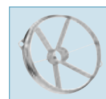
FWS-6BC Apple corer blade