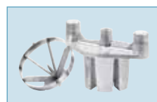
FWS-6BK Replacement wedger and blade for citrus fruits