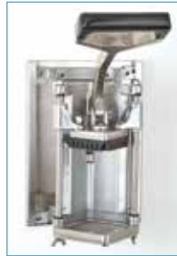
Wall mounted with HFC-BK