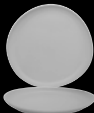
CS-1050-LG Round Plate 10.6" 1 dz.