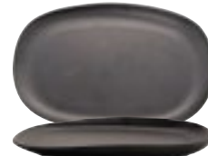
CS-1275-DG Oval Platter 12" L x 7.5" W 1 dz.