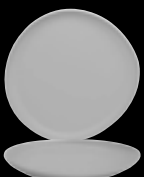
CS-710-LG Round Plate 7" 1 dz.