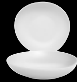
B-4500-W Round Bowl 28 oz., 9.2" L x 8.7" W 2.4" H 1 dz.