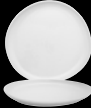
CS-1050-W Round Plate 10.6" 1 dz.