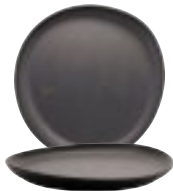
CS-910-DG Round Plate 9.1" 1 dz.