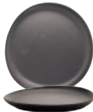
CS-1050-DG Round Plate 10.6" 1 dz.