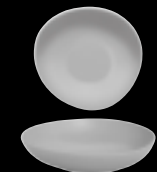
B-4500-LG Round Bowl 28 oz., 9.2" L x 8.7" W 2.4" H 1 dz.