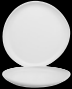
CS-710-W Round Plate 7" 1 dz.