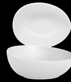
B-2000-W Oval Bowl 12 oz., 6.5" dia., 2.6" H 1 dz.