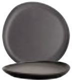
CS-710-DG Round Plate 7" 1 dz.