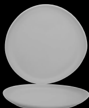
CS-910-LG Round Plate 9.1" 1 dz.