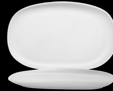
CS-1275-W Oval Platter 12" L x 7.5" W 1 dz.