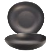
B-4500-DG Round Bowl 28 oz., 9.2" L x 8.7" W 2.4" H 1 dz.