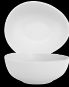
B-1200-W Oval Bowl 8 oz., 5.1" L x 4.4" W 2.1" H 2 dz.