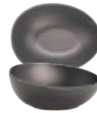
B-2000-DG Oval Bowl 12 oz., 6.4" L x 5" W 2.6" H 1 dz.