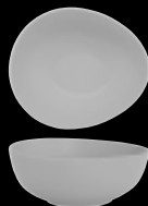
B-1200-LG Oval Bowl 8 oz., 5.1" L x 4.4" W 2.1" H 2 dz.