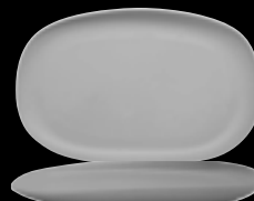
CS-1275-LG Oval Platter 12" L x 7.5" W 1 dz.