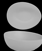
B-2000-LG Oval Bowl 12 oz., 6.4" L x 5" W 2.6" H 1 dz.