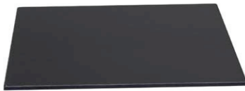
CAP-F: Full Size Pizza Heat Plate (Aluminized steel)

These exclusive Heat Plates bake everything in shorter time... for fast baking of Pizza, Breads, and other Snacks / Baked goods