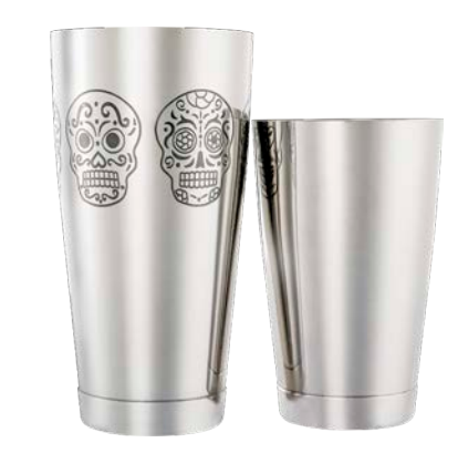
28 oz. M37008SKU