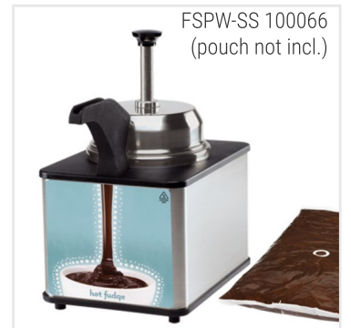
FSPW-SS 100066 (pouch not incl.)

Critical to Proper Operation | Water-Bath Spacer 82063 (incl. with 81140)