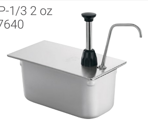
CP-1/3 2 oz 87640