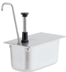
CP-1/3 Tall 83441