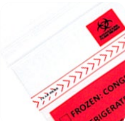
LAB-LOC SPECIMEN TRANSFER BAG