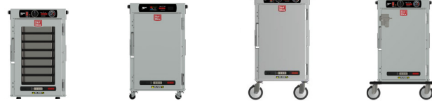
Countertop / Stacking Under Counter 1/2 Height 1/2 Height Transport