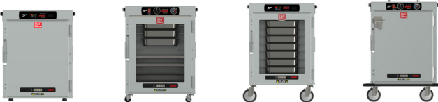
Countertop / Stacking Under Counter 1/2 Height 1/2 Height Transport