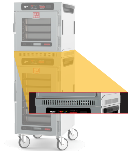
Stacking Kit for N4, N8 models Model # HBC-NSTACK Stacking Kit for W8 models Model # HBC-WSTACK