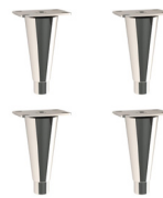
6" Stationary Legs Model # HBC-6LEGS