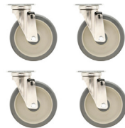
6" Transport Caster Model # HBC-T6CASTER (Only available on transport cabinets)