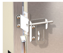
Travel Latch / Hasp (Right hinged door) Model # HBC-TRVL Travel Latch / Hasp (Left hinged door) Model # HBC-LTRVL (Not available on N4 models)