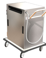
Swing-Up Handle for N8 models Model # HBC-NHANDLE Swing-Up Handle for W8 models Model # HBC-WHANDLE (Not available for N4 models)