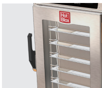
Offset Door Latch Model # HBC-OFFLATCH