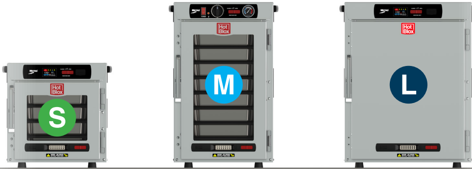
Narrow 4-Pan (N4) Holds 12x20 / GN, and 13 x 18 pans