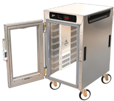
Factory Left Hand Hinging Model # HBC-LHINGE