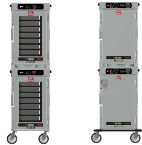
Dual Cavity Dual Cavity Transport