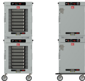
Dual Cavity Dual Cavity Transport