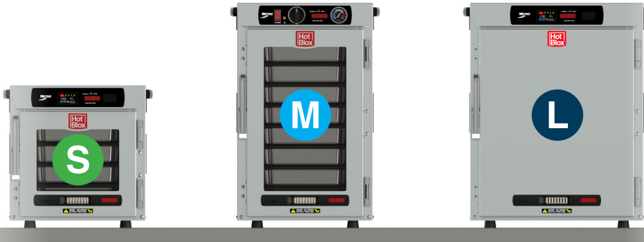
Narrow 4-Pan (N4) Holds 12x20 / GN, and 13 x 18 pans