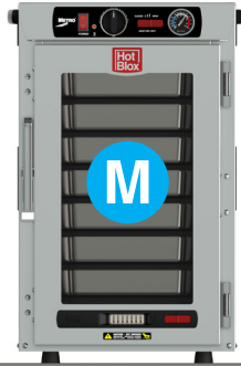
Narrow 8-Pan (N8) Holds 12x20 / GN, and 13 x 18 pans