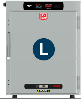
Wide 8-Pan (W8) Holds 18 x 26 pans, 12x20 / GN, and 13 x 18 pans