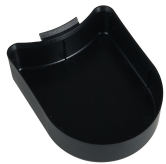
DRIP TRAY, TDO-N