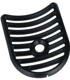
COVER, DRIP TDO-N