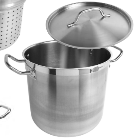
Lid Only SLSPC4012C SLSPC4020C