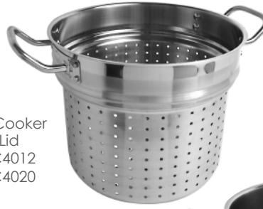
Pasta Cooker w/ Lid SLSPC4012 SLSPC4020