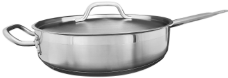
Saute Pan w/ Lid SLSAP4030 ~ SLSAP4070