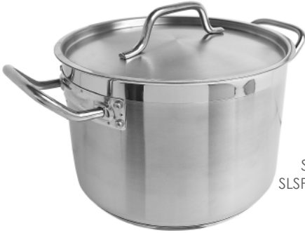
Lid Only SLSPS4008C ~ SLSPS4100C