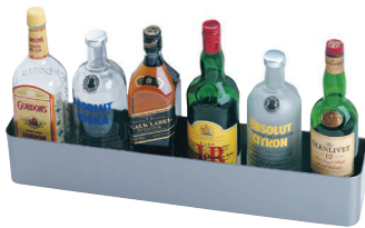
Single Speed Rail S-24 shown