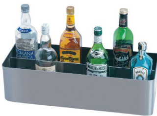
Double Speed Rail D-24 shown