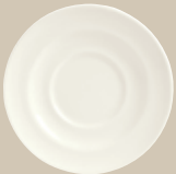
6½" Soup Cup Saucer No. 987659 393 H¾ WL2¾ 3 doz./20# • .6 cu. ft.