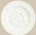
6" Saucer No. 987659 332 H½ WL1¼ 3 doz./20# • .6 cu. ft.