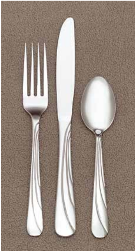
Cascade™ No. 165 Heavy Weight