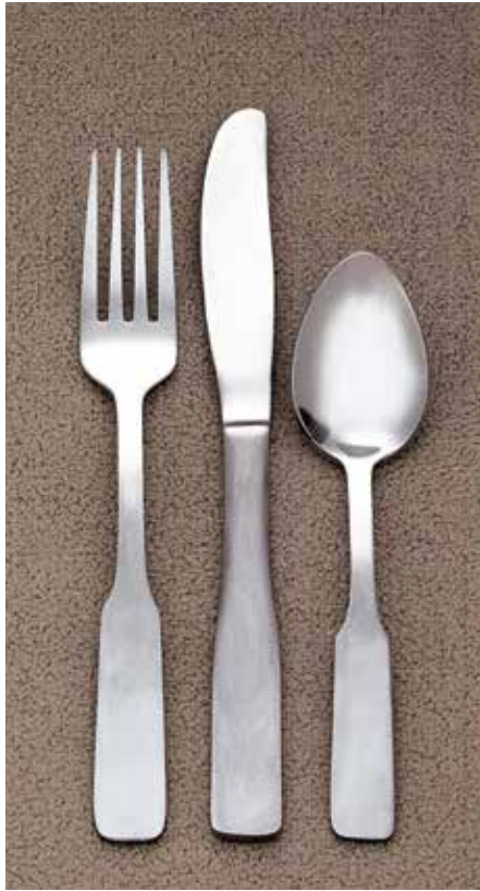
Colony No. 136 Medium Weight, Satin Finish