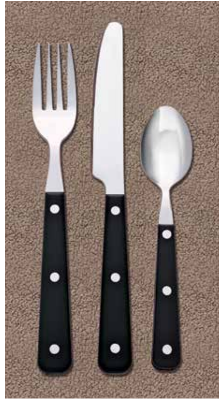
Cookout™ No. 202 Black Plastic Handle