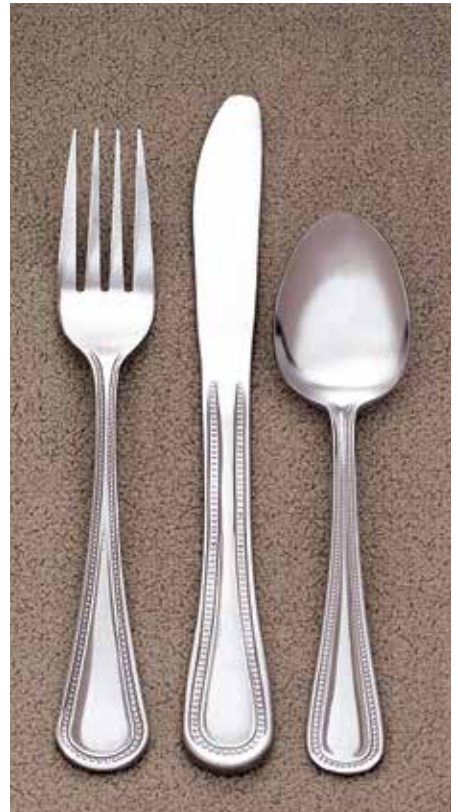
Harbour No. 130 Heavy Weight