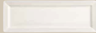
16" x 5 \frac{1}{2} " Rectangular Plate No. SL-22S H1 1 doz./31# • .6 cu. ft.