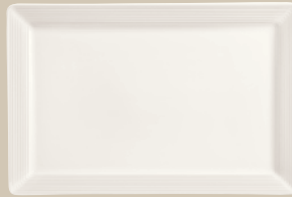
12" x 8" Rectangular Plate No. SL-26S H \frac{7}{8} 1 doz./30# • .7 cu. ft.