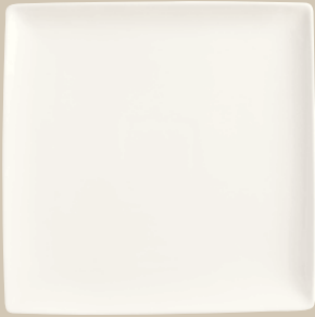
4" Square Plate No. SL-114C H \frac{1}{2} 3 doz./11# • .3 cu. ft.