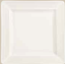
6 \frac{1}{4} " Square Plate No. SL-6S H \frac{3}{4} 3 doz./30# • .7 cu. ft.