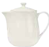
16 oz. Tea Pot w/Lid No. POT-13 Ultra Bright White H5¼ (including lid) T4¾ D6¼ 1 doz./16# • 1.2 cu. ft.