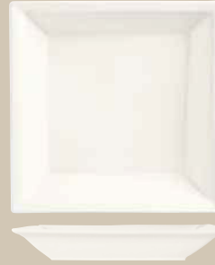
9 7/8" - 30 oz. Square, Pasta Bowl No. SL-14 H1 1/2 1 doz./33# • .8 cu ft