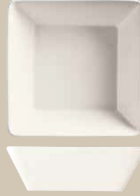
8" - 50 oz. Square Bowl No. SL-50 H2 1/2 1 doz./31# • .9 cu. ft. Fits Versa-Riser No. VR-3