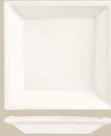
9" - 16 oz. Square, Soup, Rim Deep No. SL-13 H1 3/8 1 doz./24# • .6 cu ft