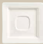
5 1/2" Square Saucer w/well ring No. SL-2 H 3/4 WL2 3 doz./23# • .5 cu. ft.