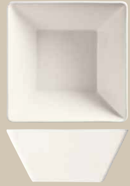
9 1/4" - 100 oz. Square Bowl No. SL-99 H4 1/8 6 pcs./26# • 1.0 cu. ft. Fits Versa-Riser No. VR-3