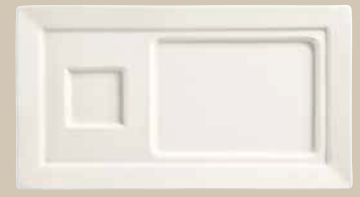
14" x 7 3/4" Soup & Sandwich Tray No. SL-29 H 3/4 WL2 2/8 1 doz./31# • .7 cu. ft.