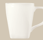
12 oz. Mug No. SL-36 H4 1/4 T3 1/2 F2 3/8 D4 3/8 3 doz./35# • 1.4 cu. ft.