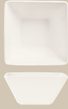
5 1/2" - 20 oz. Square Bowl No. SL-19 H2 3/8 2 doz./29# • .8 cu. ft.