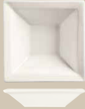
7" - 12 oz. Square, Grapefruit No. SL-12 H1 1/2 2 doz./31# • .6 cu ft