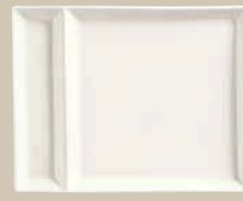
9" x 7" Plate, Cocktail No. SL-900 H1 1/8 2 doz./33# • .7 cu. ft. Also shown on page 60