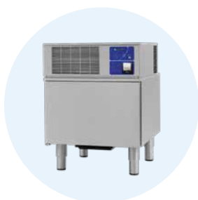
SINGLE-CAVITY Reach-in Units

VERSITILITY | Thermo-Kool has a Blast Chiller & Shock Freezer that's the perfect fit for every kitchen