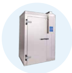
STANDALONE Roll-in Units