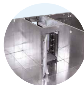
INTEGRATED Roll-in Units