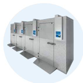
MULTI-COMPARTMENT Roll-in Units