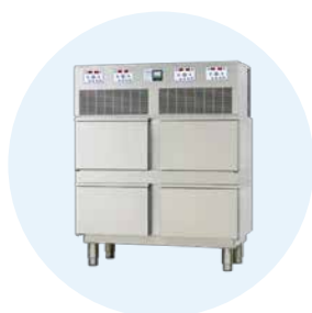
MULTI-CAVITY Reach-in Units