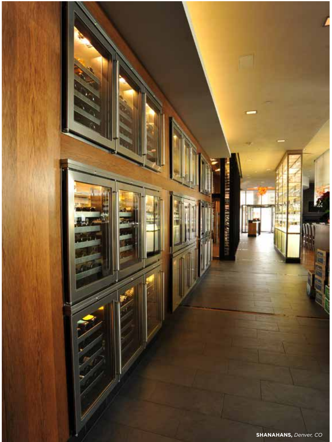
SHANAHANS, Denver, CO