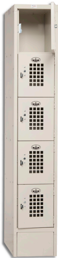
WL-55 1 Column 5 Doors