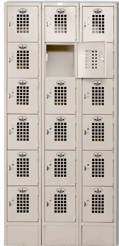
WL-618 3 Column 18 Doors