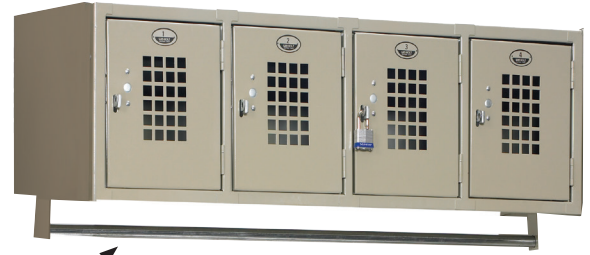
WL-4 4 Doors with Garment Bar Garment bar provides Coat Storage