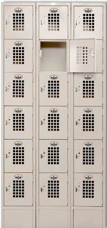
WL-618 3 Column 18 Doors