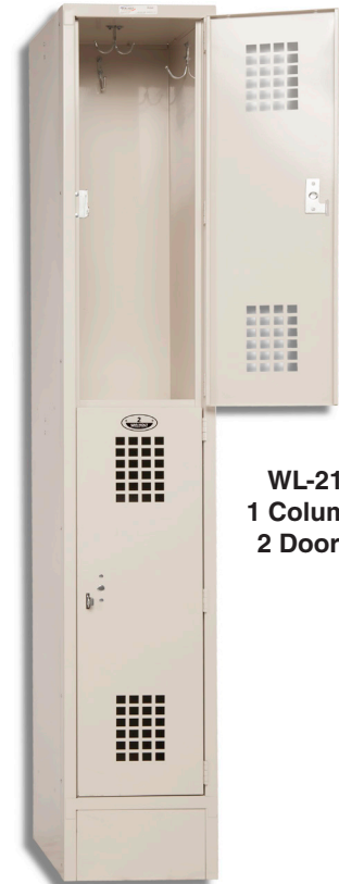
WL-21 1 Column 2 Doors

Option: Specify option by adding suffix to Model Number listed. -ST...Slanted Top