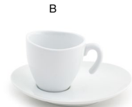
B 2 oz Ellipse™ Cup & Saucer 4.75 x 4 x 2.25 in | 12 x 10.2 x 5.8 cm, 59 ml