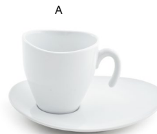
A 8 oz Ellipse™ Cup & Saucer 6 x 7.25 x 3.75 in | 15 x 18.1 x 9.8 cm, 237 ml