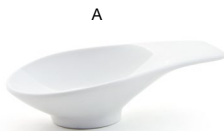
A 6" Oval Footed Sampler™ - 2 oz 6 x 3.75 x 1.75 in | 15 x 9.7 x 4.4 cm, 59 ml