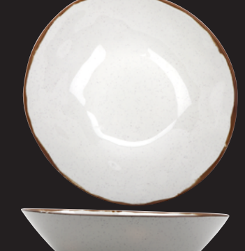
B-353-RM Round Bowl 11 qt. 18" dia. 4.5" deep 3 ea.