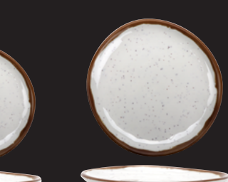
CS-10-RM Round Plate 10.5" 1 dz.