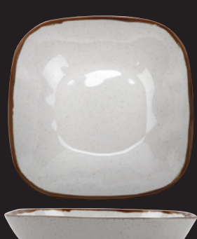
SB-182-RM Square Bowl 5.7 qt. 13" length 3.5" deep 3 ea.