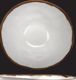
B-193-RM Round Bowl 6 qt. 13" dia. 5.5" deep 3 ea.