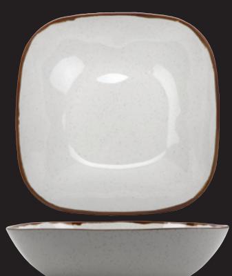
SB-410-RM Square Bowl 12.8 qt. 16.75" length 4.5" deep 3 ea.