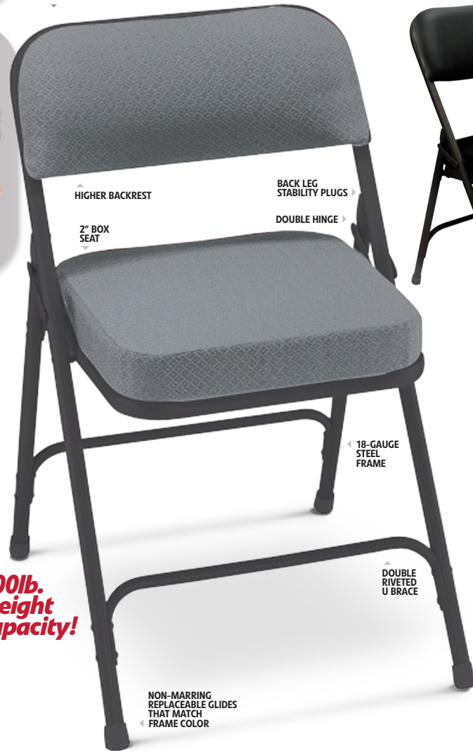
MODEL 3201 SHOWN