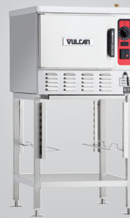
Electric Counter Model