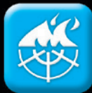
Heavy Duty Cooking