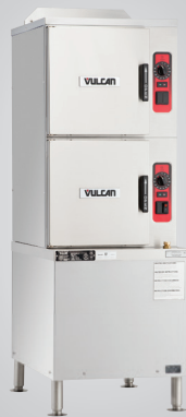
Gas/Electric Convection Floor-Standing Model