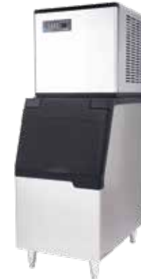
IM-0460-AH-22 shown with IB-026-22