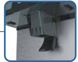
UV Sterilization - Detachable inner chute for cleaning and sterilization