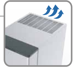
Air Discharge on Top