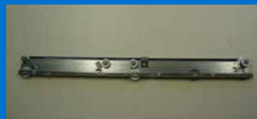
Easily removable drawer tracks for cleaning in a dishwasher.