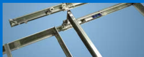
Heavy-duty integral stainless steel drawer cage assembly fully welded together for incredible strength